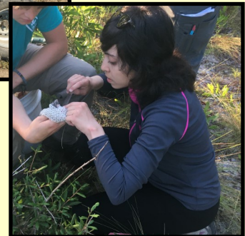
Lentil small mammal trapping.