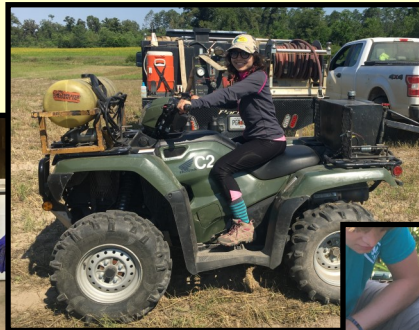
Lentil on ATV.