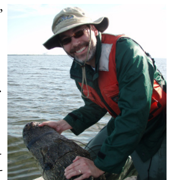
Florida Chapter of The Wildlife Society President