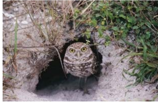
Burrowing owl image and text below from Florida Fish and Wildlife Conservation Commission website .